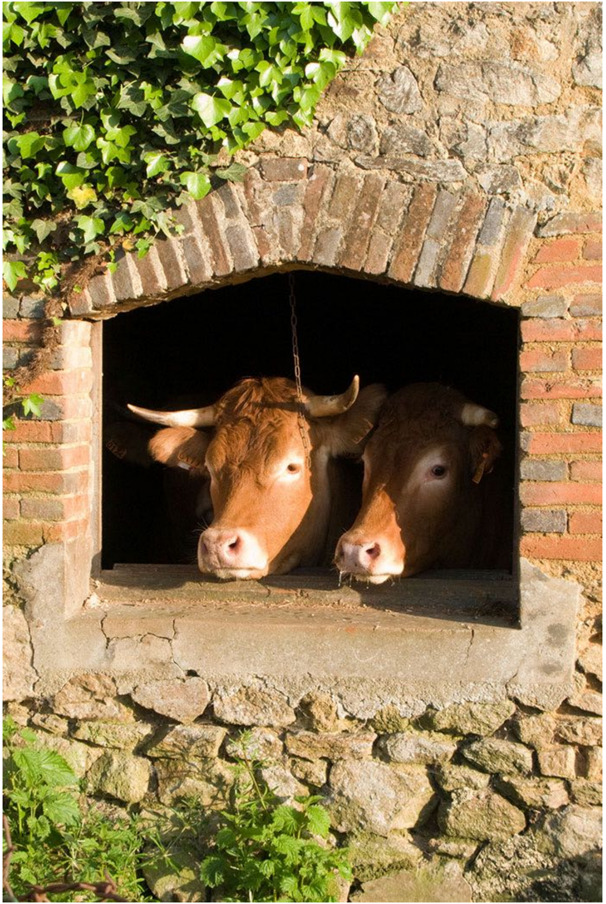
Limousin cattle in a barn near Limoges.