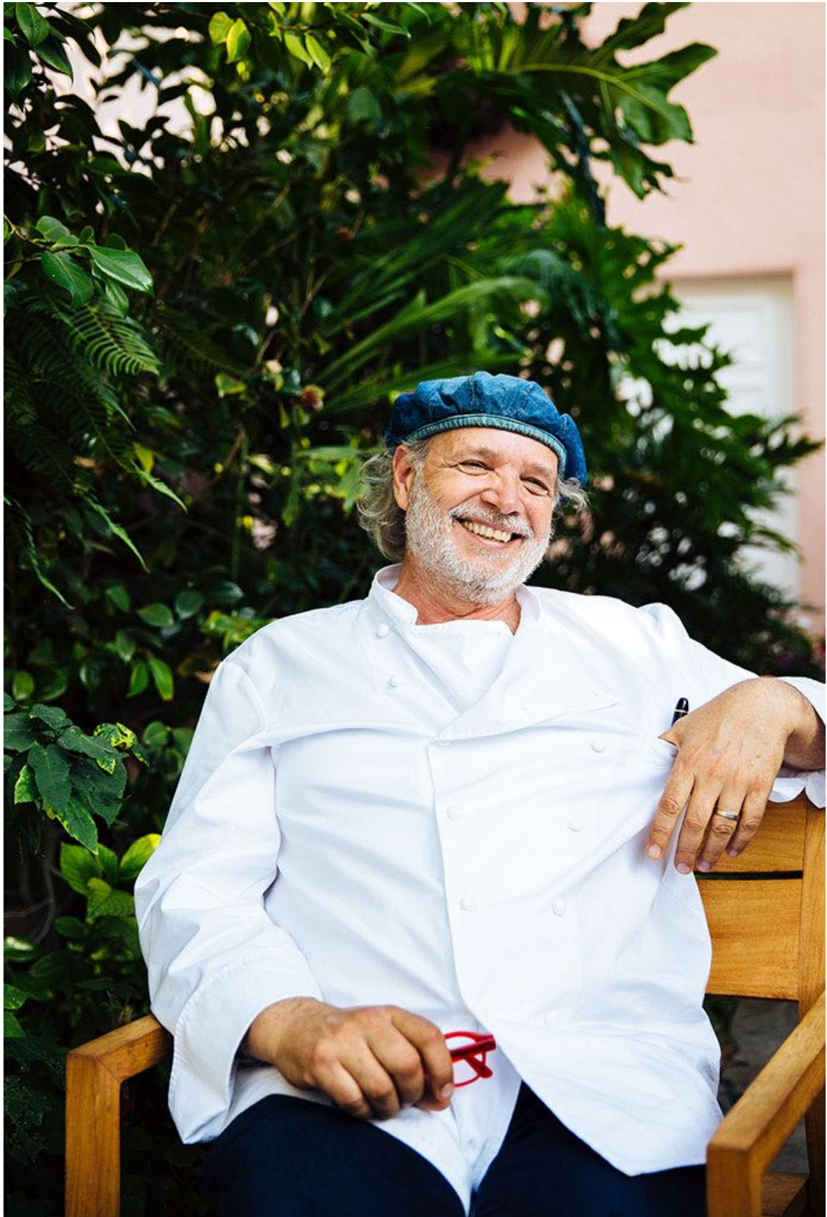
Francis Mallmann relaxes away from cooking duties.