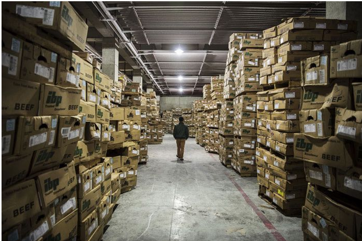
Boxes of American steak sit in a warehouse in Suzhou, China, July 2018.