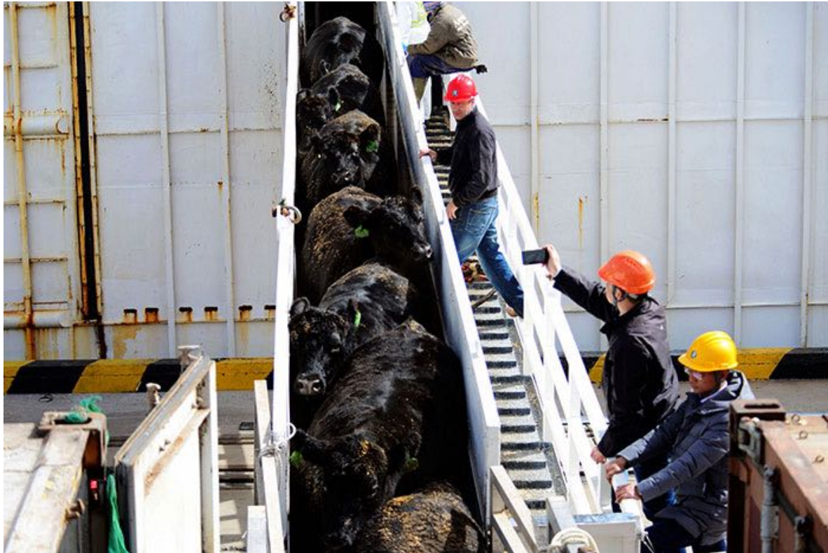
Live cattle imported from Australia arrive in Qingdao, Shandong province.