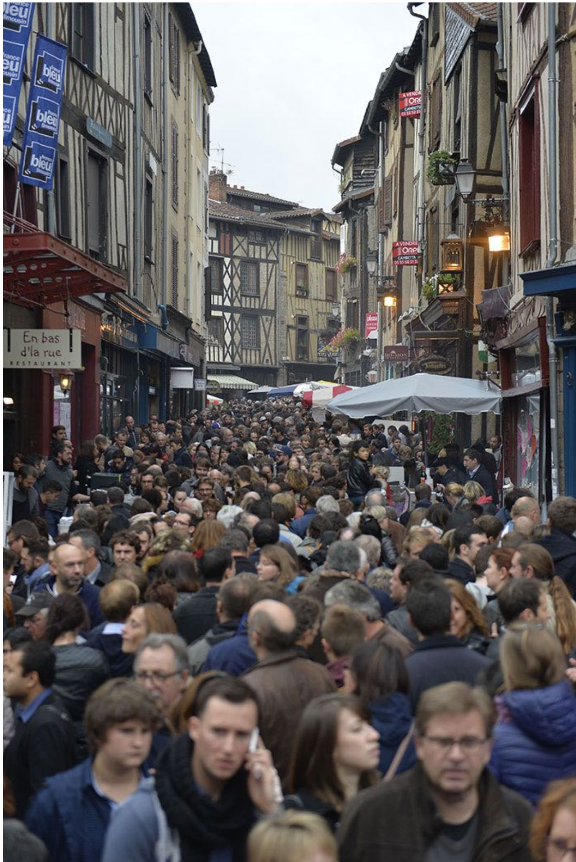
People attend the 43rd “Frairie des Petits Ventres” in 2016.