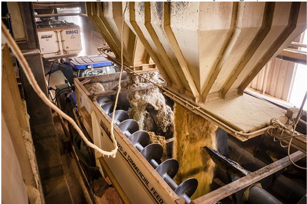
Feed is prepared for the 160,000 cattle on the feedlot.