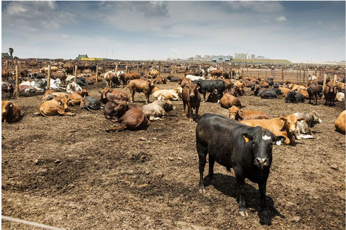
Cows on the Karen Beef (Pty) Ltd. site in Heidelberg, South Africa.